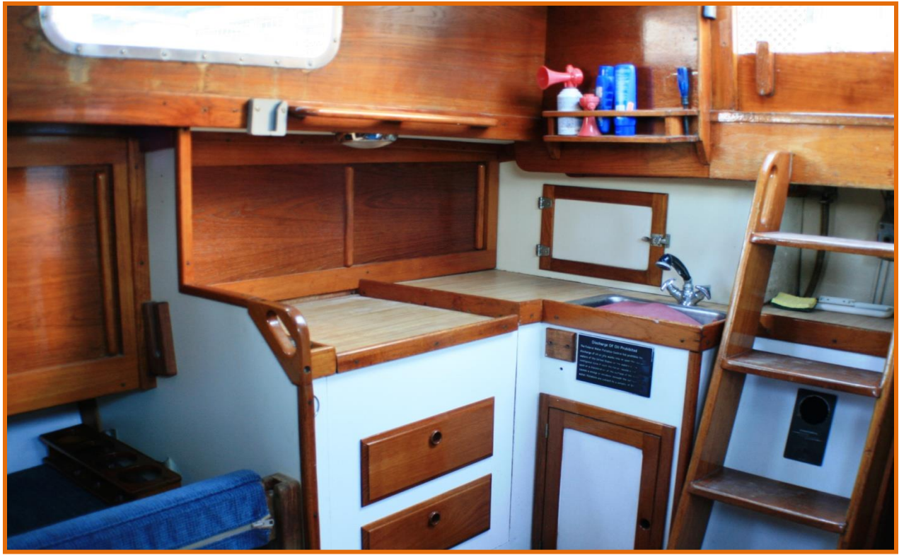
FROLIC's Present Galley - ( note new sliding teak doors, pressure water w/spray hose faucet, and butcher-block counter top)