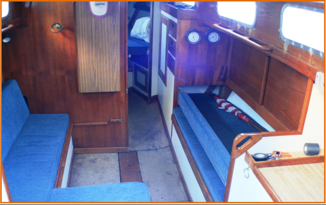
Main cabin - port side settee & double berth, and pilot berth