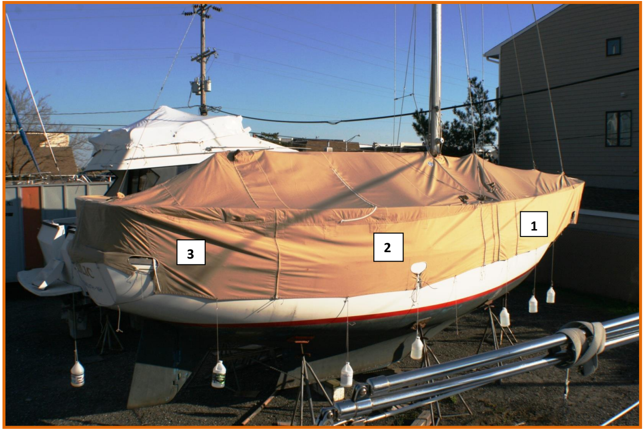
Three-section Sunbrella winter cover