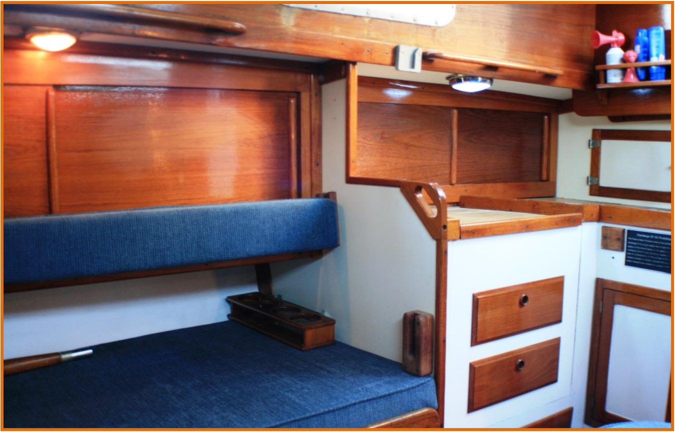
Starboard pilot berth & galley