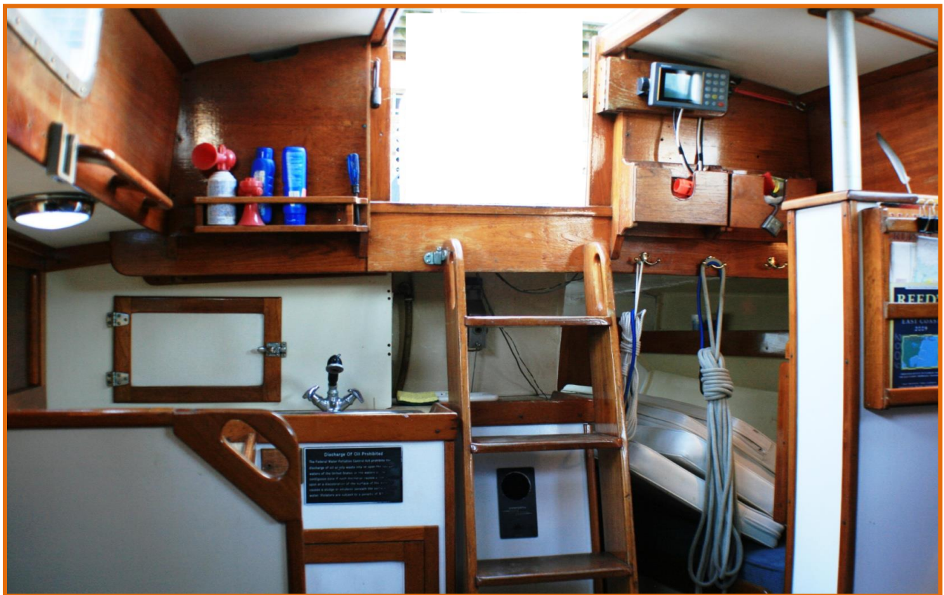
Icebox, companionway & aft quarter-berth (w/ cockpit cushions)