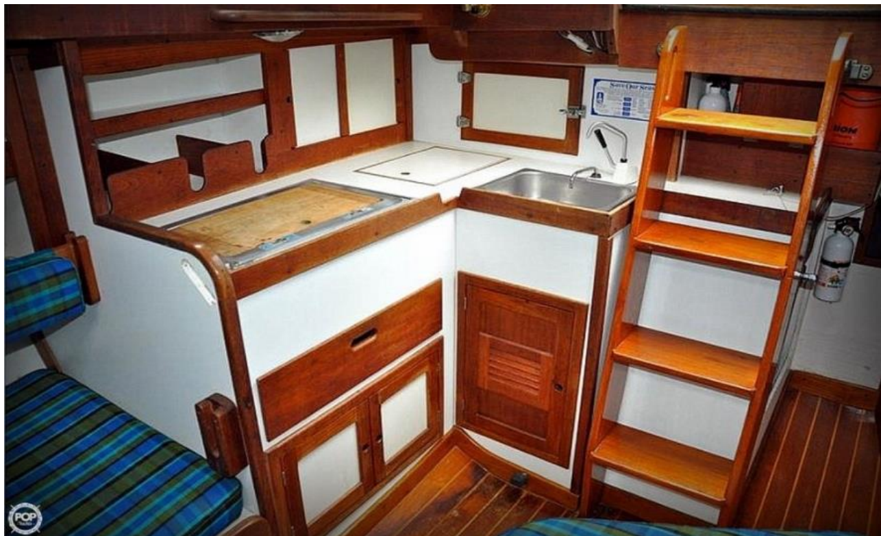
ORIGINAL 1974) Galley - ( note the countertop, open bay, and manual sink faucet w/ foot pump)