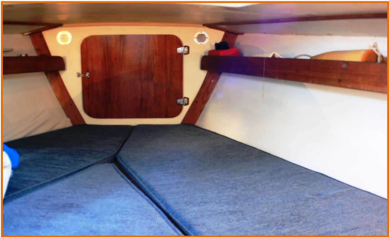
V-berth & anchor locker