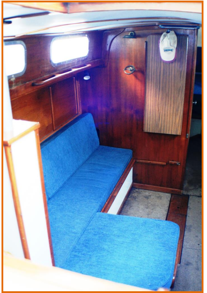
Port-side settee & double berth