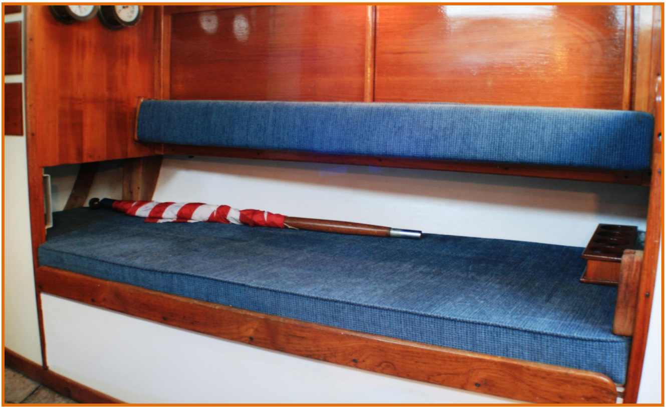
Starboard pilot berth – w/ padded fiddle board